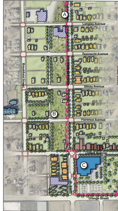
Coal Line Trail / College Gardens concept for College Street