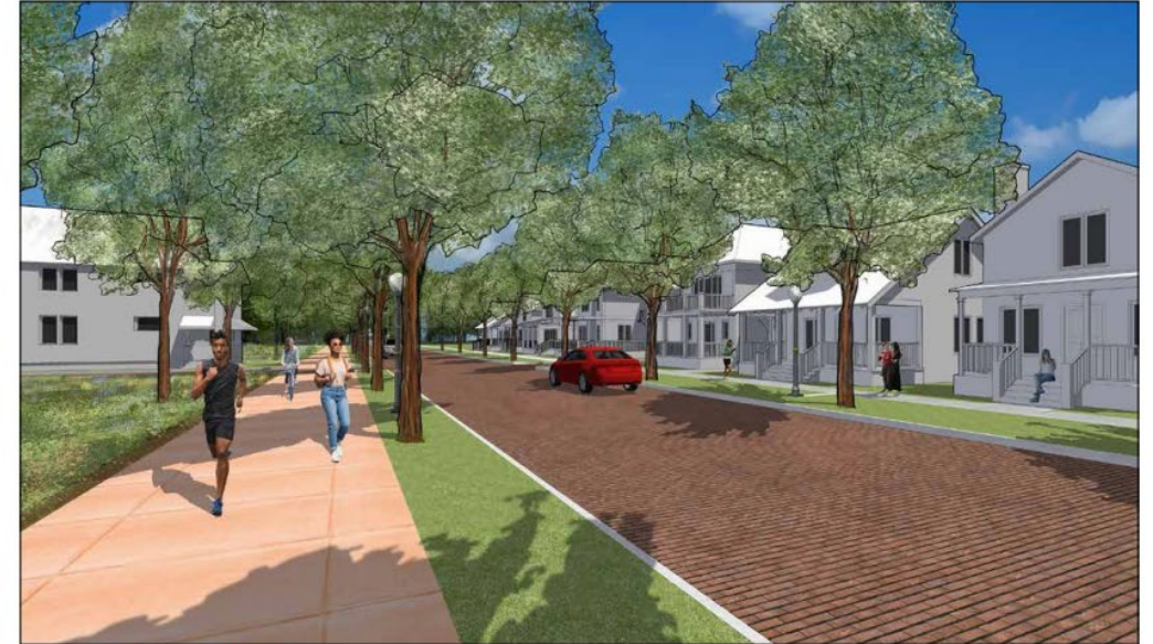
Coal Line Trail on College Street looking north.