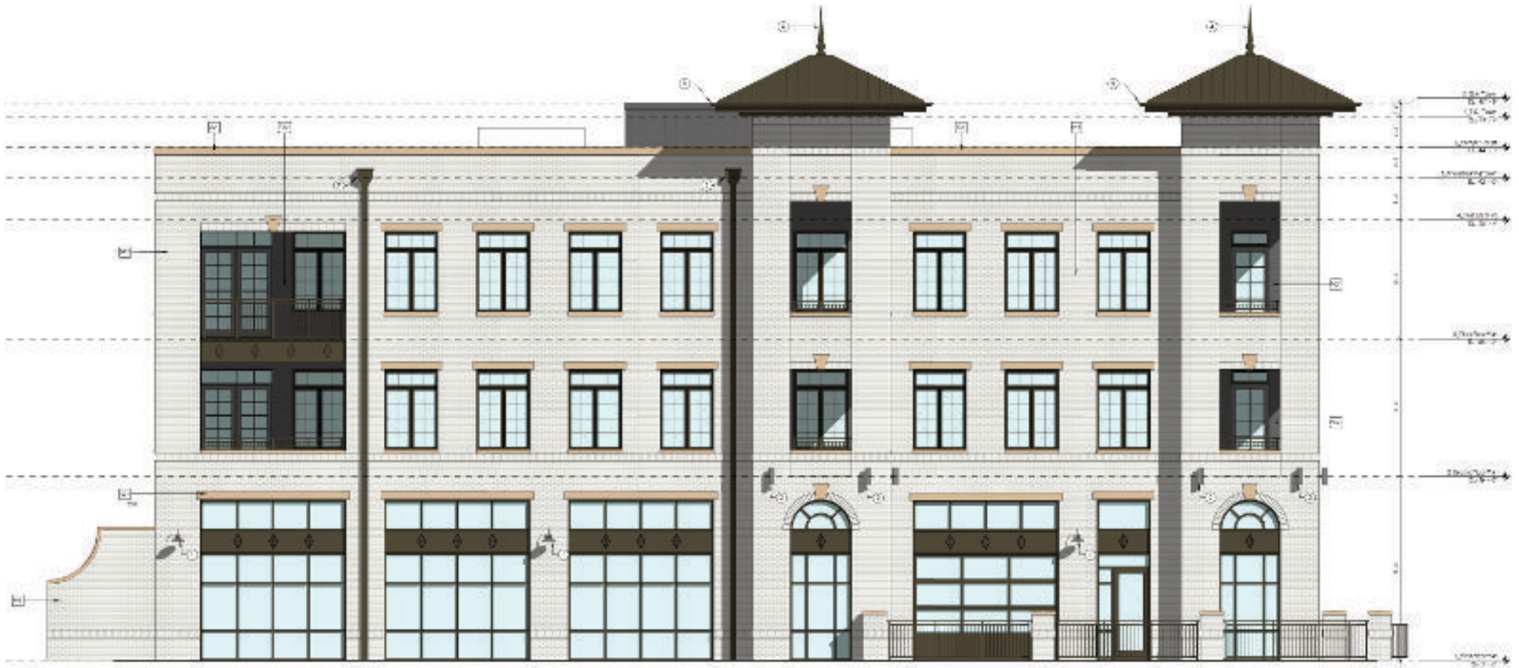
Mixed Use Building Elevation