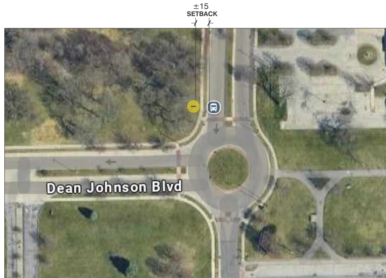
SITE MAP NTS