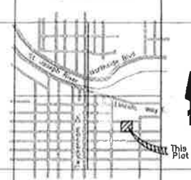
Vicinity Map SCALE: 1" = 200'