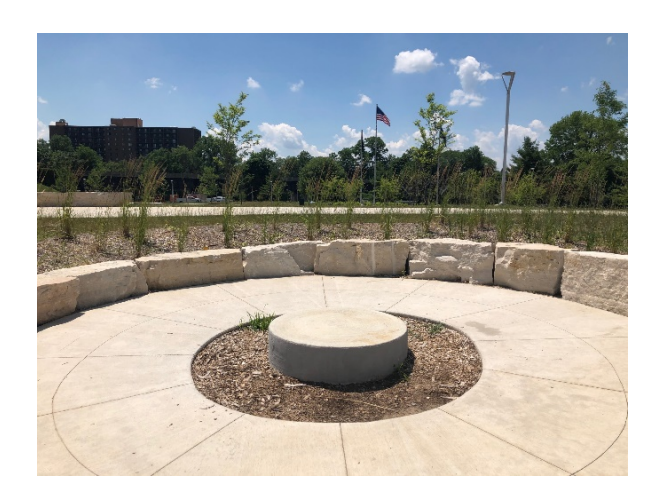
3 feet 10 inches

See the map below for the four locations where artwork will be placed.