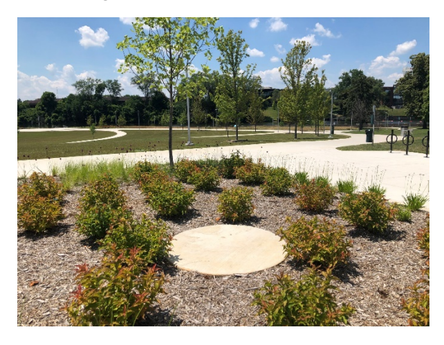
3 feet 11 inches

Images of each location are below. Dimensions for each art pad are also listed below.