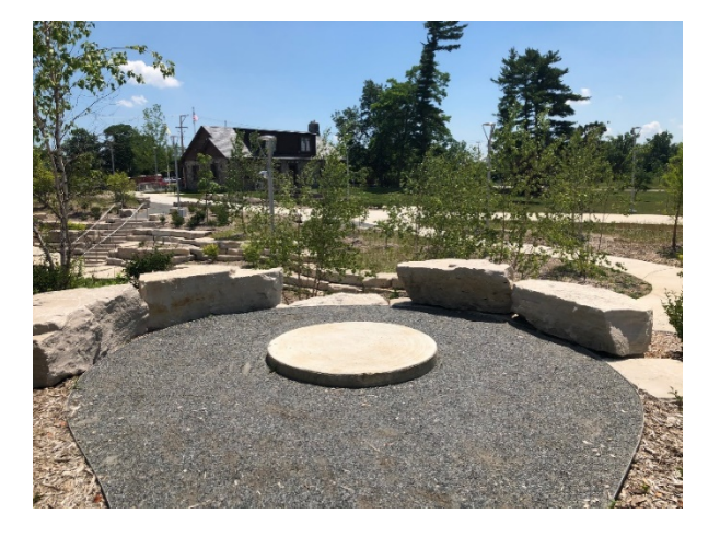
3 feet 11 inches