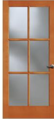
37106 Thermal Sash (SDL)