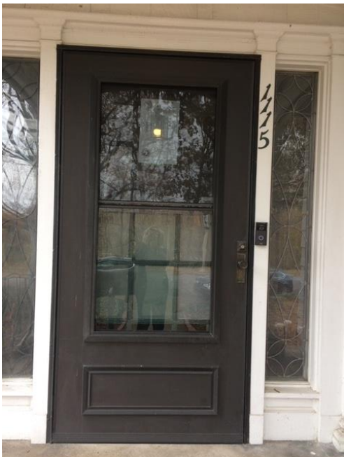
Front Door (for comparison)