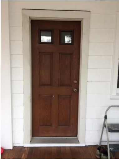
Existing Back Door