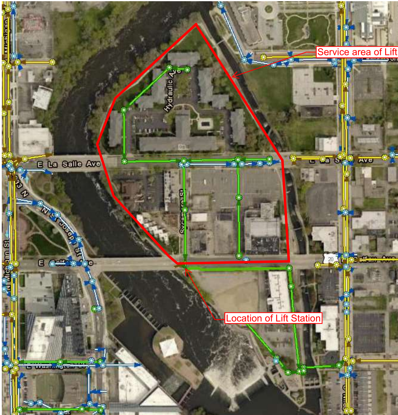
Aerial View of East Race area served by Colfax Lift Station