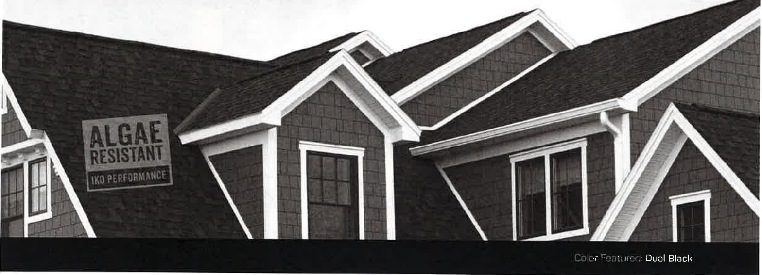
Color Featured: Dual Black