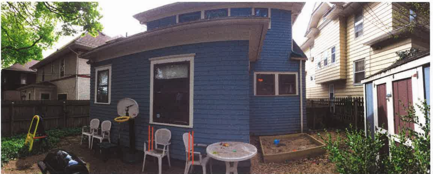
View of rear elevation from backyard (proposed door opening is shown in red)