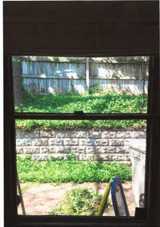
View of backyard from Playroom