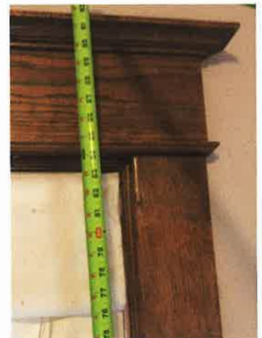
Window head detail (interior)