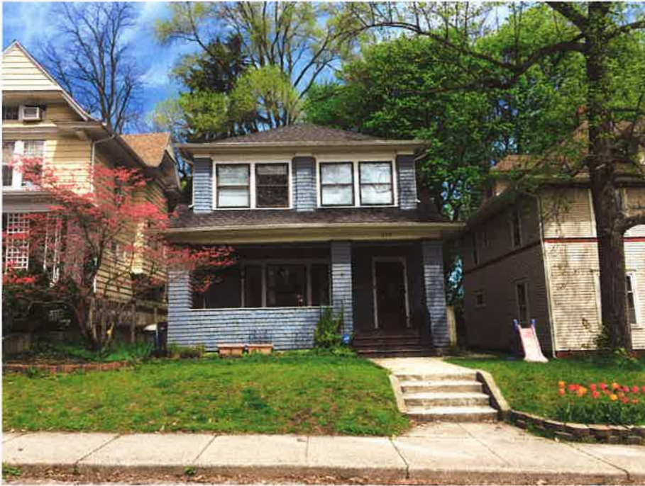
View from street