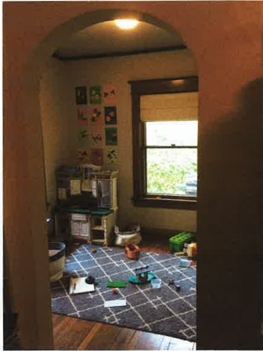
View from kitchen