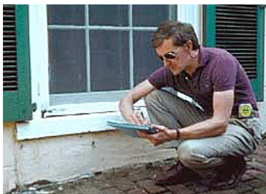
FIGURE 18.2 Historic properties should have a window condition assessment preceding work.

For each historic property, some elements will be of greater significance than others. As part of a survey of each historic property, the responsible entity should identify the elements that could be altered or removed without harming the integrity of the historic resource (e.g., plain plaster surfaces, simple board trim with no distinctive features, and non-historic intrusions, such as replacement windows). Generally, the front facades of buildings will be more significant than the less visible side and rear elevations. Public spaces on the first floor, such as the entrance area and main staircase, will generally be more significant than private spaces, such as the bedroom, kitchen, and bath. This information will be important when decisions are made about where to perform interim controls and where abatement or encapsulation is appropriate.