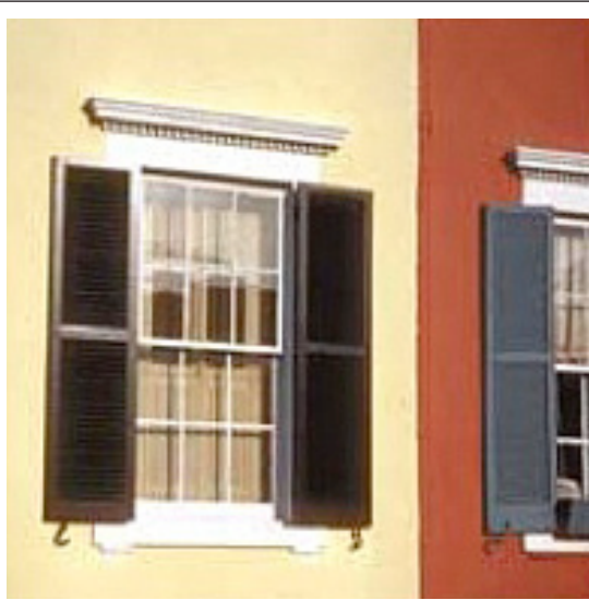
FIGURE 18.1 Delicate muntins and multi-pane sash on early 19th century row houses.

The quality of a building’s architecture and craftsmanship must be considered when evaluating the significance of a property. Buildings that exhibit distinctive characteristics of architectural design represent work by skilled craftsmen, or have high artistic value may require a greater sensitivity on the part of a responsible entity when undertaking alterations or modifications to that structure (see Figure 18.1). Worker housing in an industrial mill town was often constructed with heavy timber post and beam construction or balloon frame wooden systems, but may have very simple decorative or trim work on the interior. The significance of these properties is more closely tied to social movements within our cultural history than to architectural design. A property designed by a prominent architect using master craftsmen and artistic painters will be noted for its architectural appearance and design.