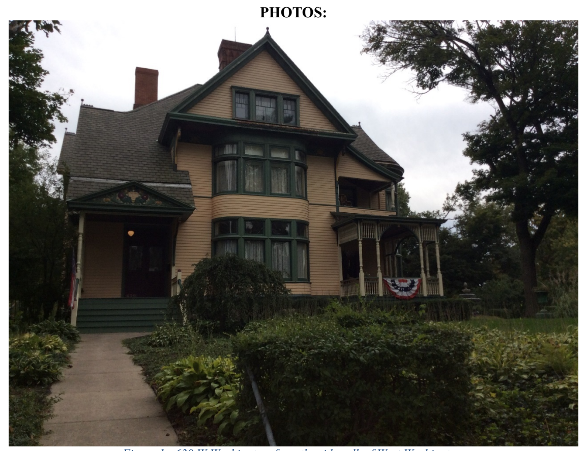
Figure 1 - 630 W Washington, from the sidewalk of West Washington.