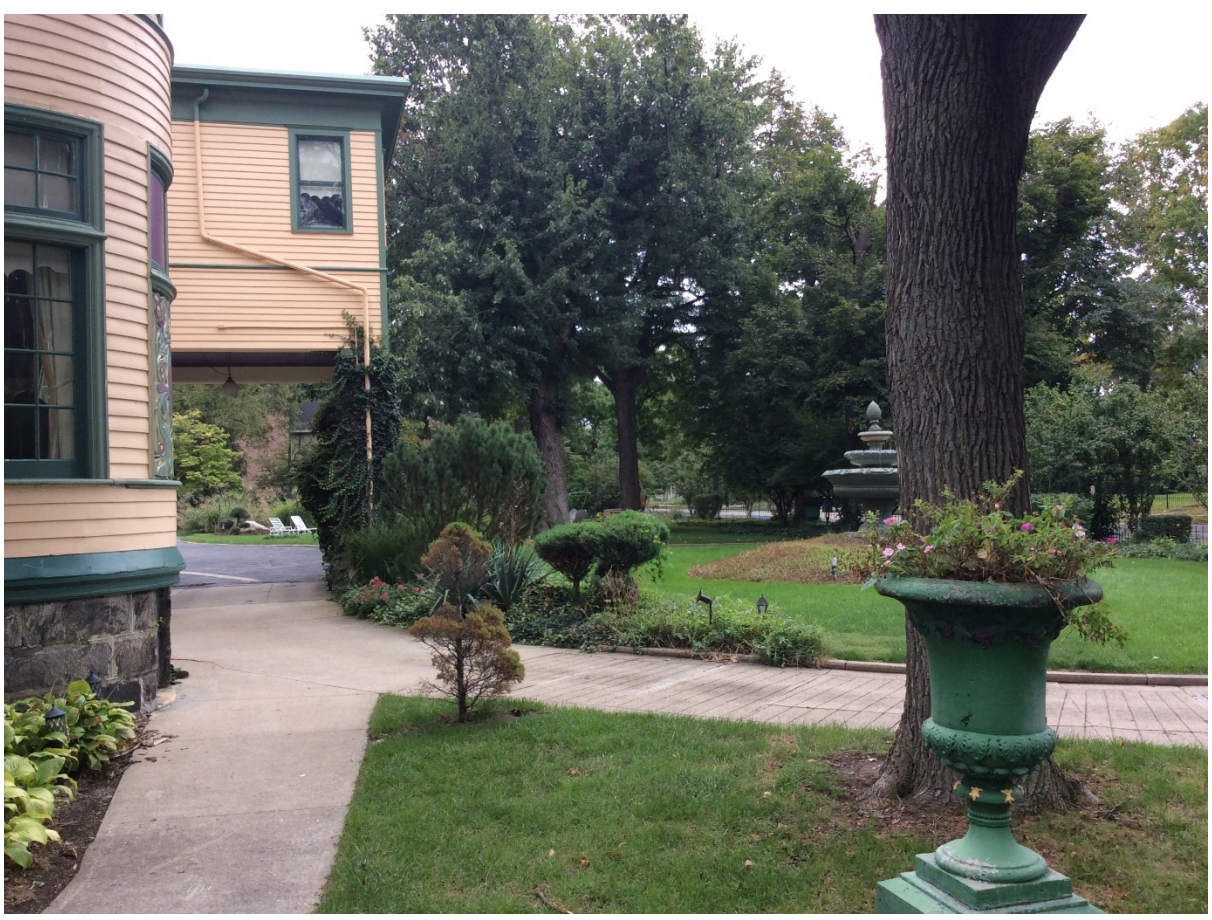
Figure 5 - Looking south from the front yard towards the porte cochere.