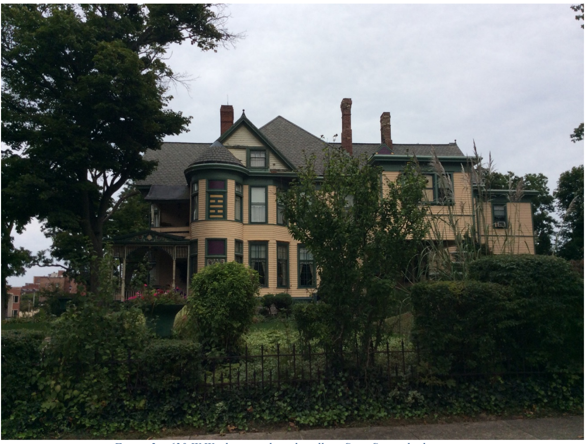
Figure 2 – 630 W Washington the sidewalk on Scott Street, looking east..