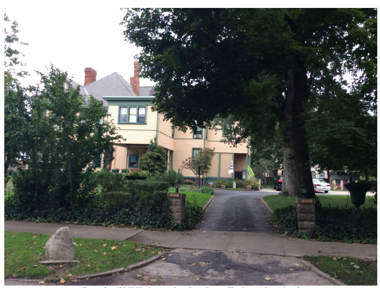
Figure 3 – 630 W Washington from Scott Street. The drive to be replaced.