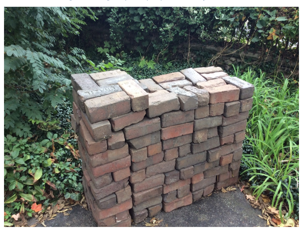
Figure 6 - The pavers to be used.