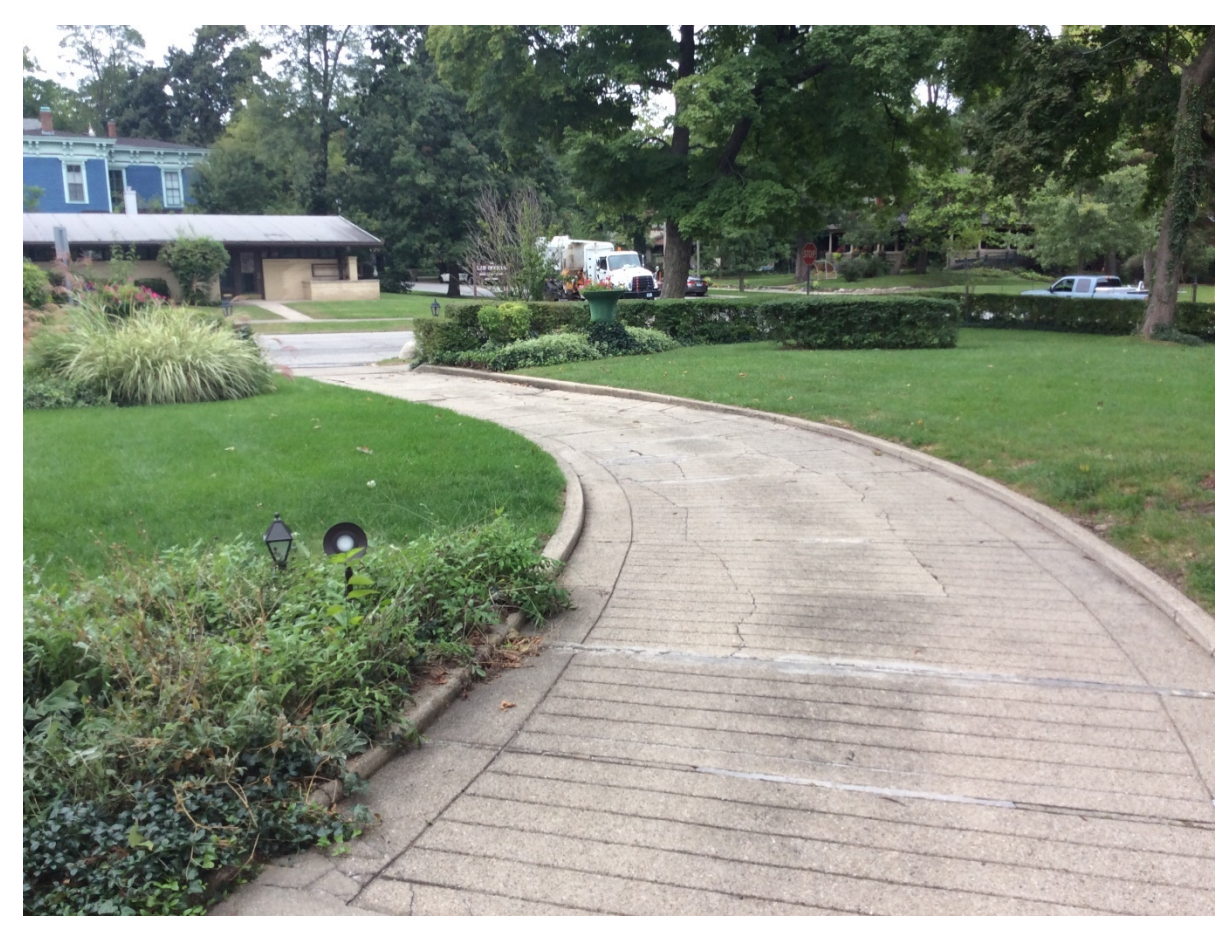
Figure 4 - The drive, looking northwest, away from the porte cochere.