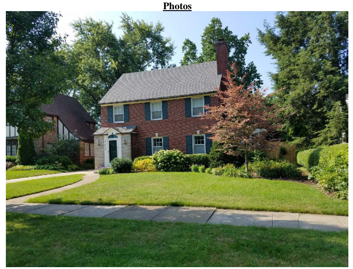
Figure 1-1708\,E Wayne north elevation, from the street. New fence visible from the street at right.