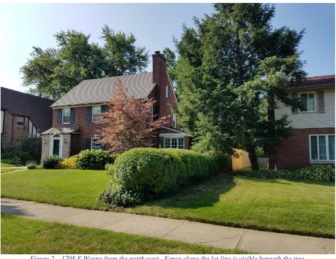
Figure 2 – 1708 E Wayne from the north west. Fence along the lot line is visible beneath the tree.