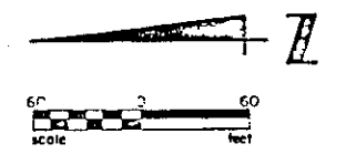
SITE PLAN SHOWING CONTOURS OF THE PIEZOMETRIC SURFACE TORRINGTON COMPANY BANTAM BEARING DIVISION SOUTH BEND, INDIANA

NOTE GROUNDWATER CONTOURS DEPICTED ARE A GENERALIZED INTERPRETATION OF THE PIEZOMETRIC SURFACE AT THE SITE. THEY ARE BASED UPON WATER ELEVATIONS MEASURED AT 8 INTERPOLATED BETWEEN COMPLETED MONITORING WELL LOCATIONS. ACTUAL WATER LEVEL WILL VARY ACROSS THE SITE DEPENDING UPON SPECIFIC SUBSURFACE & CLIMATIC CONDITIONS.