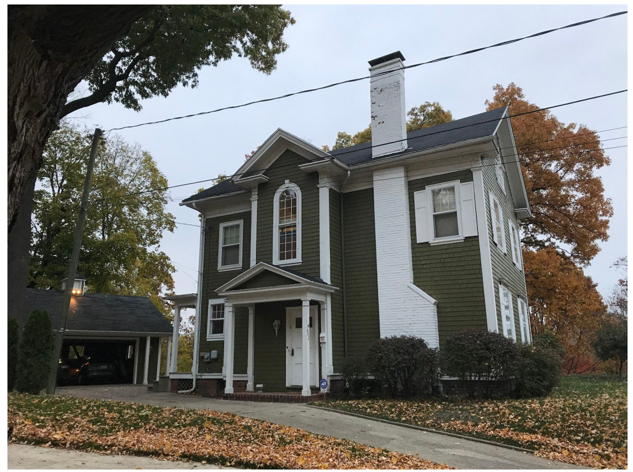
902 Riverside Dr., South Bend IN 46616; Nov. 6, 2019; ~7:30am