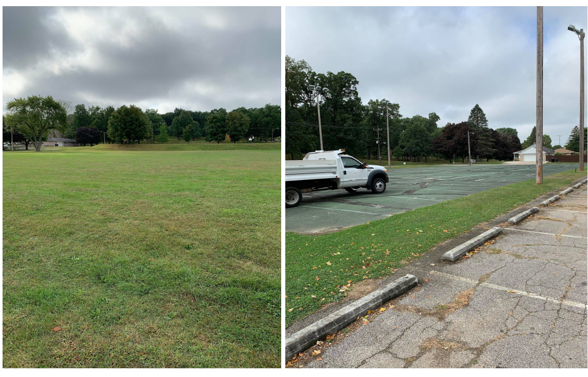
Space at Walkerfield Park for a soccer field