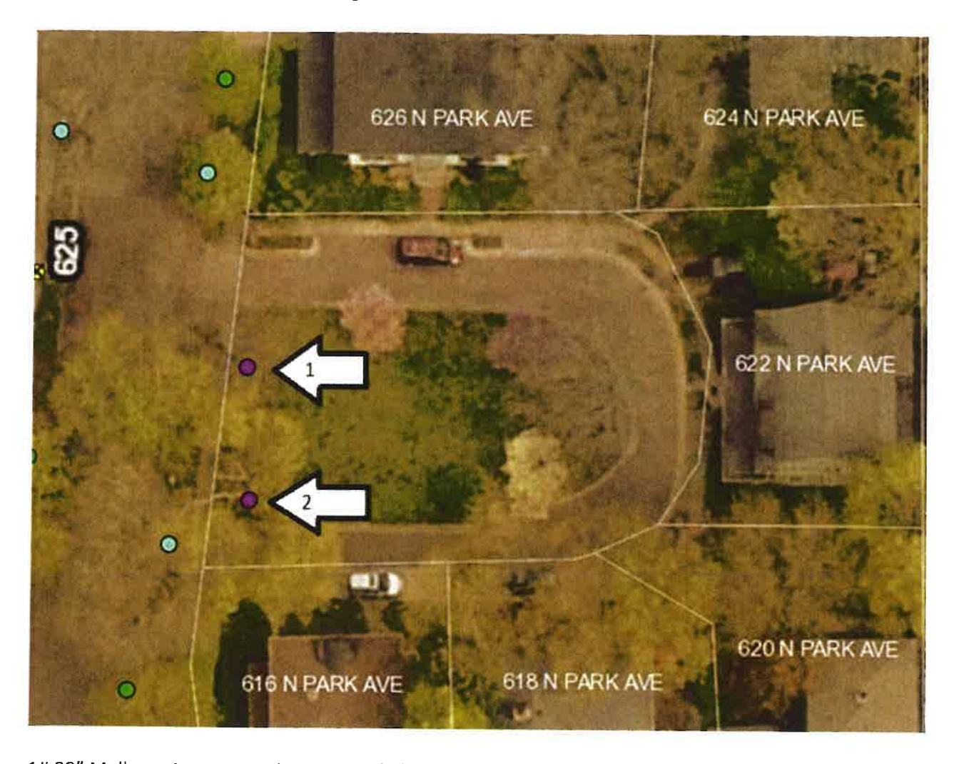
1# 29" Mulberry in poor condition two split limbs (white arrows). Recommendation remove and replace.

To: Stan Molenda <smolenda@southbendin.gov>