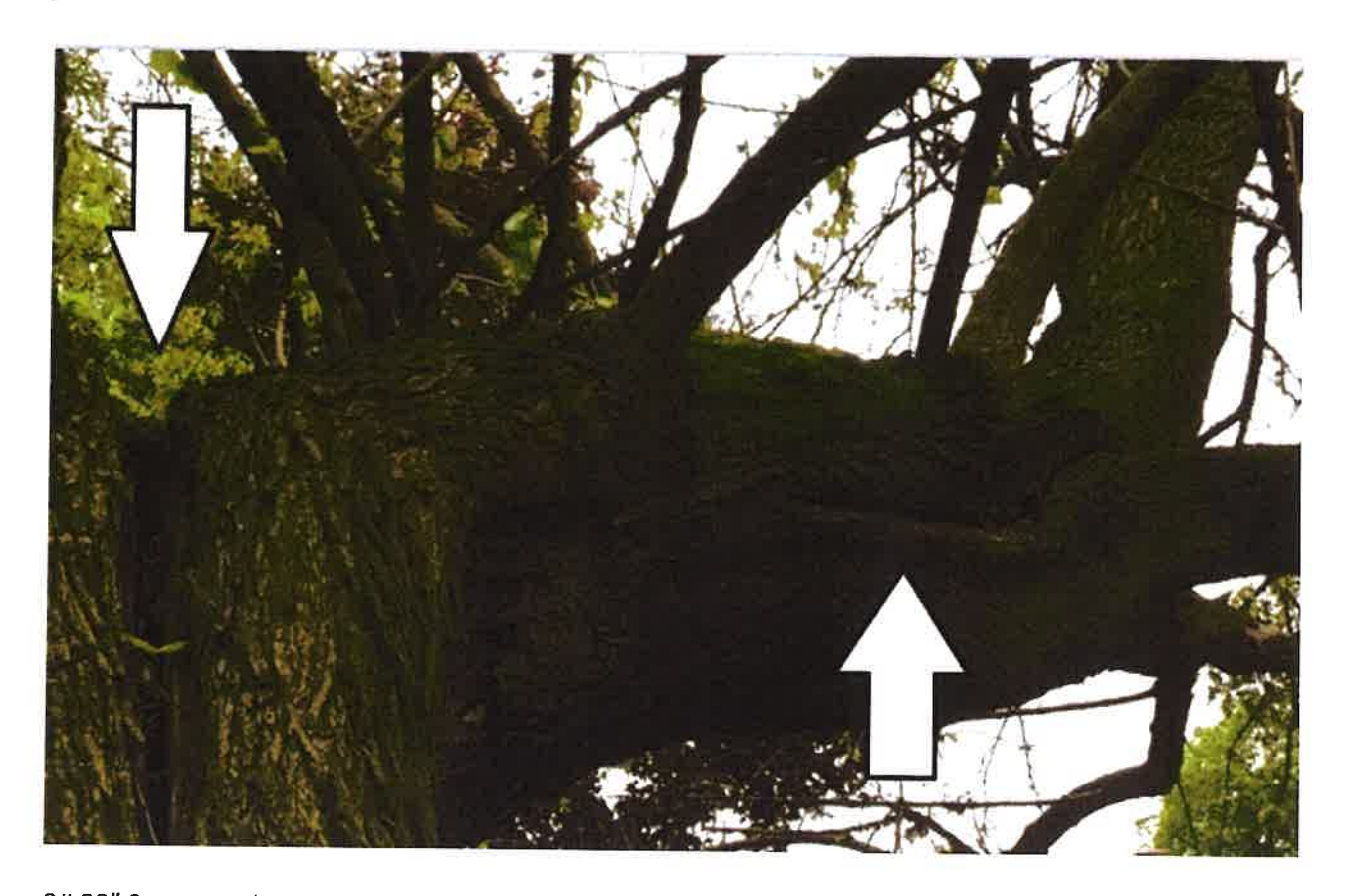
2# 32" Sugar maple in poor condition with two weak branch unions (yellow arrows) Recommendation remove and replace or prune deadwood and a tree support system.