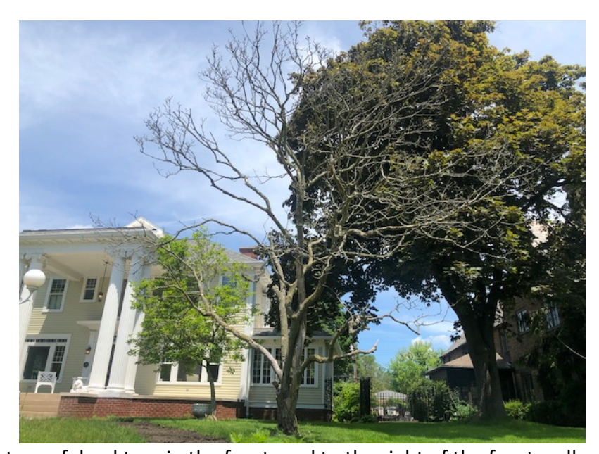
Picture of dead tree in the front yard to the right of the front walkway.

We have a dead Saucer Magnolia tree in the front yard. It has been declared dead by an arborist (see attached). We would like to remove the tree and replace it with another Saucer Magnolia (Magnolia x soulangeana) to match the other three living Saucer Magnolia's in the front yard. The new tree will be planted within 10 feet of where the dead tree stands. Removal of the dead tree would take place as soon as approval is granted. The new tree would be planted at the soonest possible date taking into account tree availability and recommended tree planting season (most likely Sept/Oct 2019).