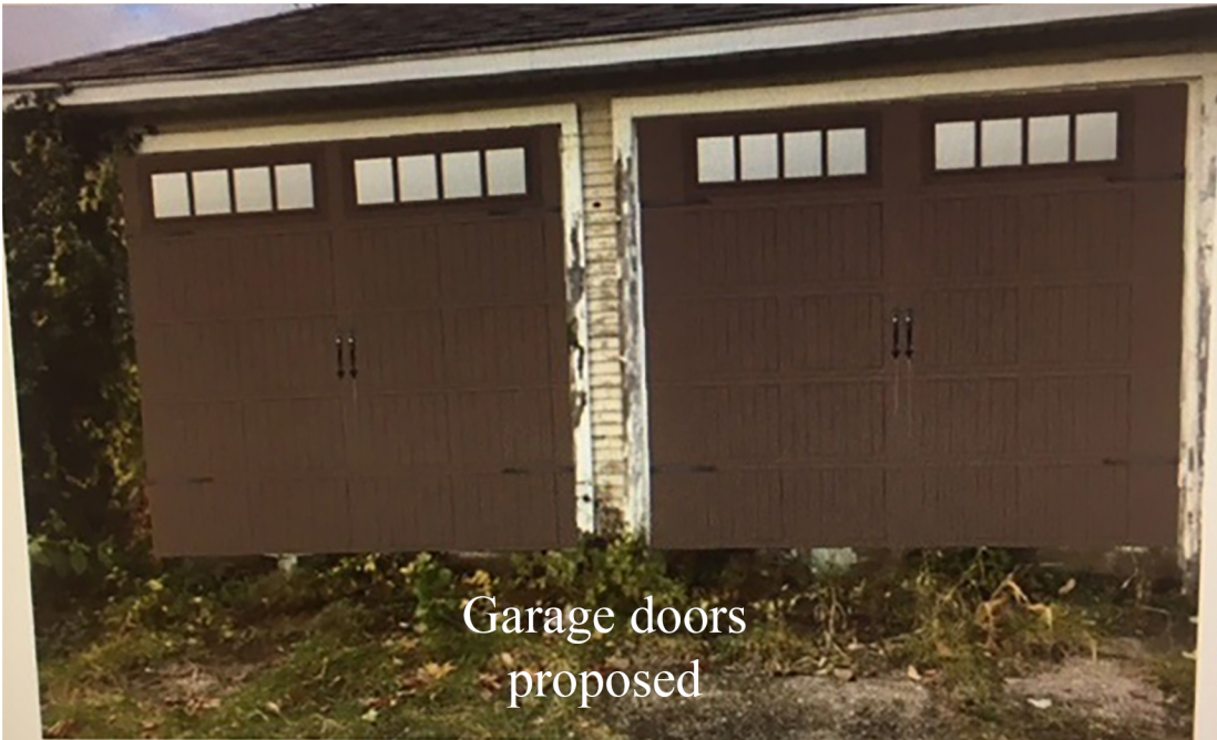
Garage doors proposed