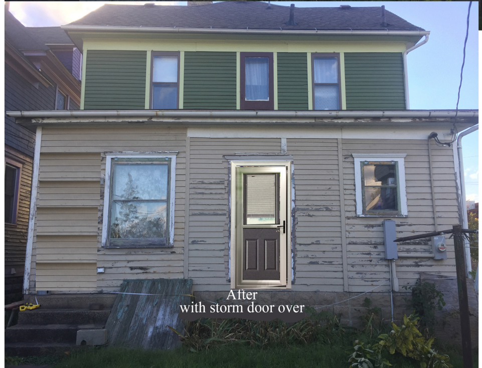
After with storm door over