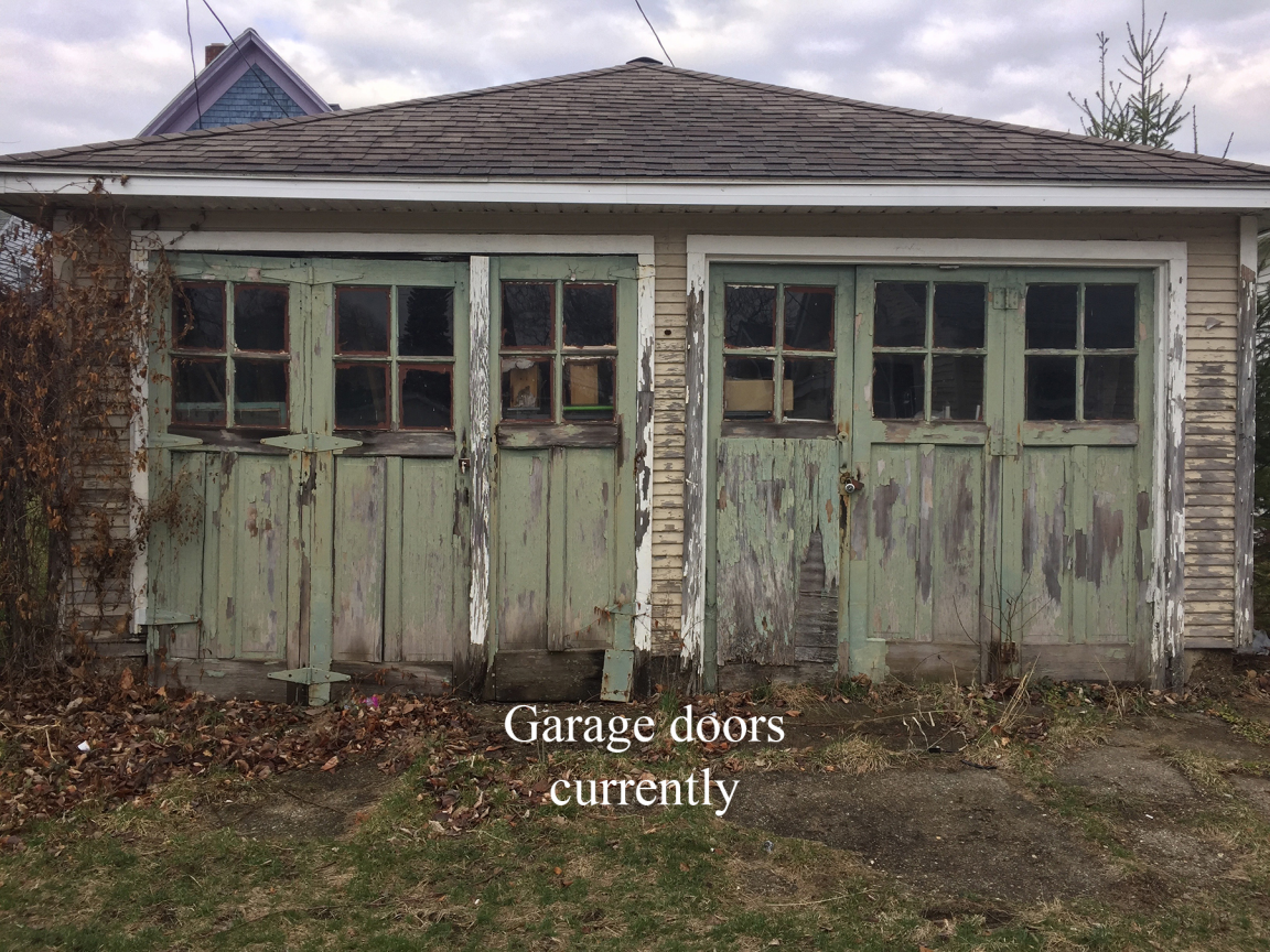
Garage doors currently