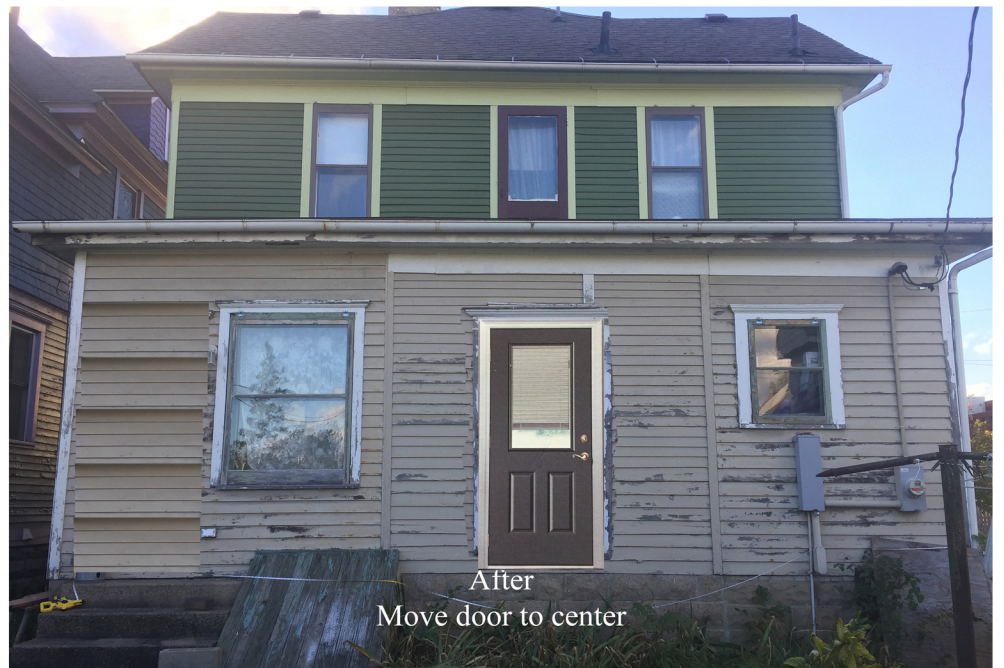
After Move door to center