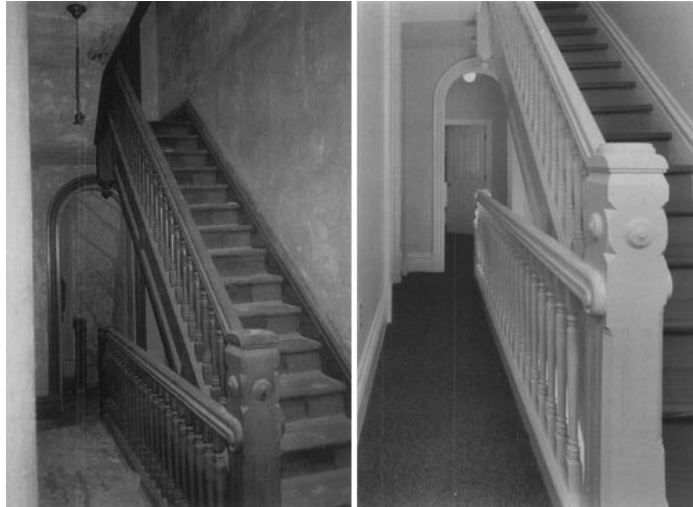
A large-scale historic rehabilitation project incorporated sensitive lead-hazard reduction measures. Interior walls and woodwork were cleaned, repaired, and repainted and compatible new floor coverings added. The total project was economically sound and undertaken in a careful manner that preserved the building's historic character. Before:left, after:right.

It is important that owners of historic properties be aware that layers of older paint can reveal a great deal about the history of a building and that paint chronology is often used to date alterations or to document decorative period colors. Highly significant decorative finishes, such as graining, marbleizing, stenciling, polychrome decoration, and murals should be evaluated by a painting conservator to develop the appropriate preservation treatment that will stabilize the paint and eliminate the need to remove it. If such finishes must be removed in the process of controlling lead hazards, then research, paint analysis, and documentation are advisable as a record for future research and treatment.