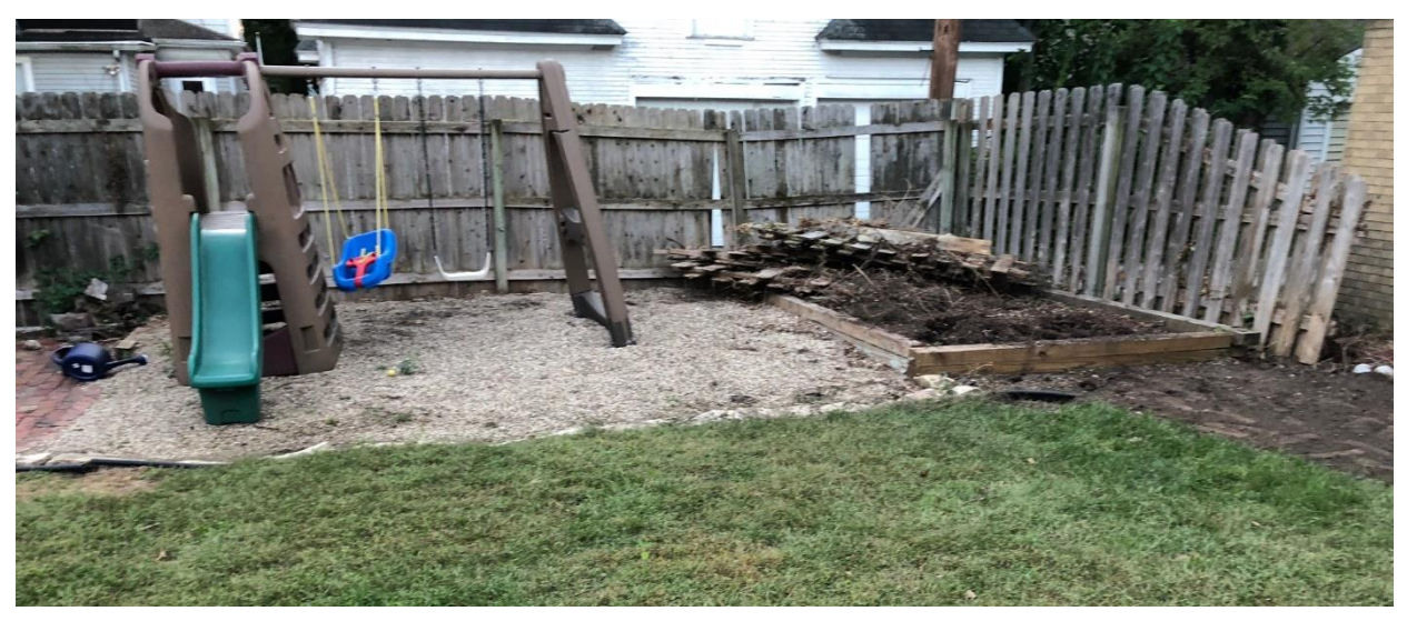
Current state: 4' picket fence was removed by homeowner in October 2018 in order to remove overgrown vegetation..

State of the fence as of August 2018. 6' privacy fence adjoining alley is missing several planks, and several posts are badly deteriorated. 4' picket fence on side of yard was overgrown with vegetation and fence posts were rotten.