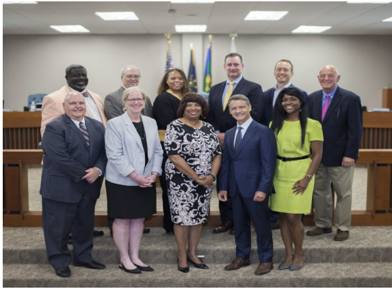
2016-2019 South Bend Common Council, City Clerk and Council Legal Team